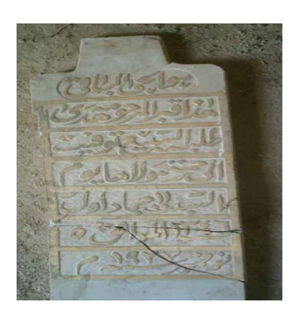
Pl.6- Tombstone of Huda Tulba al-Subei' (Photographed by researcher published for first time)