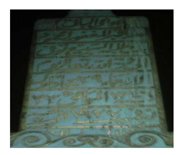
Pl.5- Tombstone of Mahmoud Bey Tulba al-Subei'