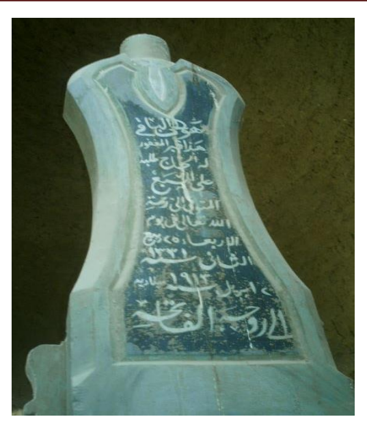
Pl.2-Tombstone of Tulba Ali al-Subei (photographed by researcher published for first time)