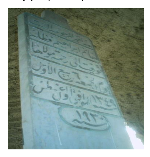
Pl.7- Tombstone of Hanim Ibrahim Fazlah (Photographed by researcher published for first time) - 142 -