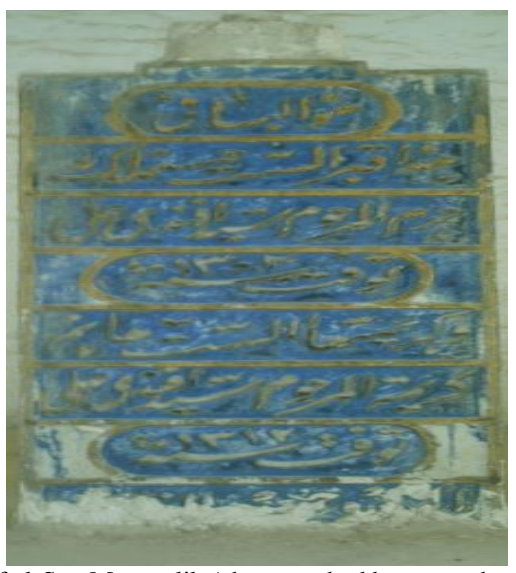
Pl.1Tombstone of al-Sett Mestamlik