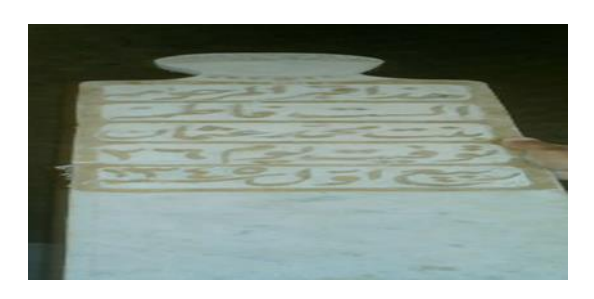
Pl.4-Tombstone of Fatima the daughter of Mohammed Othma