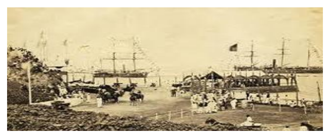
Fig 1 : represents Suez arsenal

2013 ، السويس التي لا تنسى " الجزء الأول " ، ( روز اليوسف ) ، 23 أكتوبر 2013 ، http://www.rosaelyoussef.com/news/2662/%D8%A7%D9%84%D8%B3%D9%88%D9%8A%D 8%B3-%D8%A7%D9%84%D8%AA%D9%89-%D9%84%D8%A7 %D8%AA%D9%86%D8%B3%D9%89%D9%80 12:17 ، 2019\5\2019\600