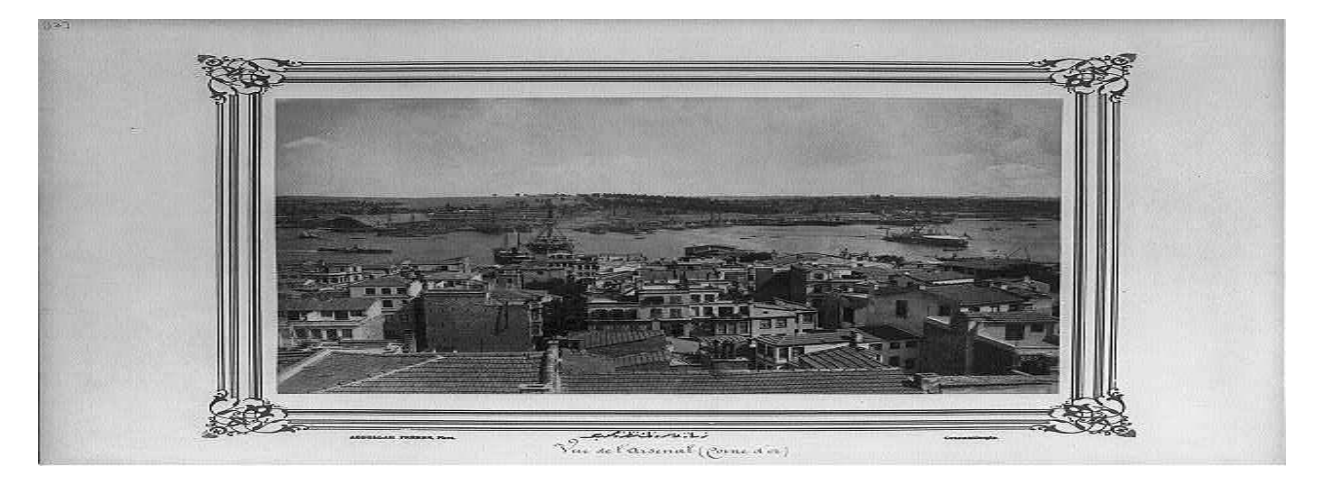
Fig 4 : represents general view of the imperial arsenal

https://cdn.loc.gov/service/pnp/cph/3b20000/3b28000/3b28500/3b28526r.jpg#h=470&w=640 last access 23\5\2019, 6:40 AM